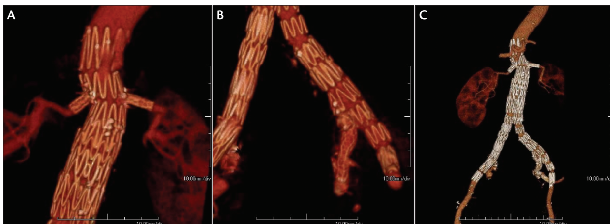
Figure 2. A three-dimensional volume-rendering CT reconstruction of the proximal part of the fenestration graft showing a patent Advanta V12 stent (Atrium Medical Corporation, Hudson, NH) in both renal arteries. The stents are well-flared and positioned adequately (A). A three-dimensional volume-rendering CT reconstruction of the IBD stent showing a patent Advanta V12 stent in the left internal iliac artery (B). A three-dimensional multiplanar CT reconstruction of the fenestration stent graft and IBD (C).

The complexity of her aneurysm anatomy is shown in Figure 1. The CT scan showed an infrarenal abdominal aortic aneurysm with a maximum anteroposterior diameter of 4.2 cm (Figure 1A). The origins of both common iliac arteries were aneurysmal, with the right measuring 3.6 cm in maximum diameter and the left measuring 2.5 cm (Figure 1B). The internal iliac arteries were also aneurysmal, with the right measuring 2.1 cm in diameter (Figure 1C). The renal artery origins were normal, as were the origins of both the superior mesenteric artery and celiac axis.